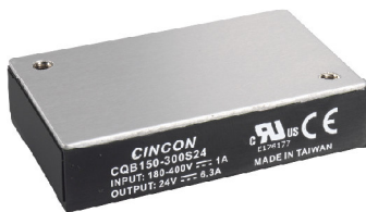
CQB150-300S (150 W) Size : Quarter Brick 180 ~ 425 Vdc input