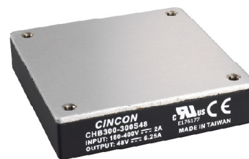
CHB300-300S (300 W) Size : Half Brick 180 ~ 425 Vdc input