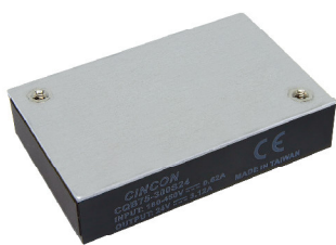
CQB75-300S (75 W) Size : Quarter Brick 180 ~ 450 Vdc input