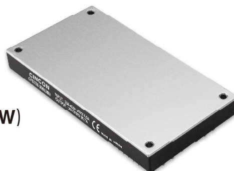
CFB750-300S (750W) Size : Full Brick 200 ~ 425 Vdc input