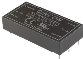
EC7BW18 (20W) Size : 2 x 1 inches 8.5~160 Vdc input