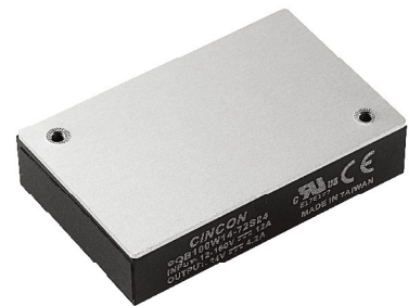
CQB100W14 (100W) Size : Quarter Brick 12~160 Vdc input